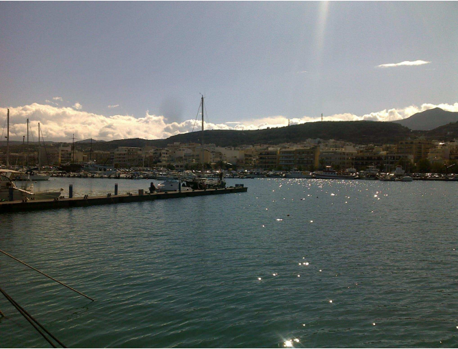
View of pier A – Marina of Rethymno