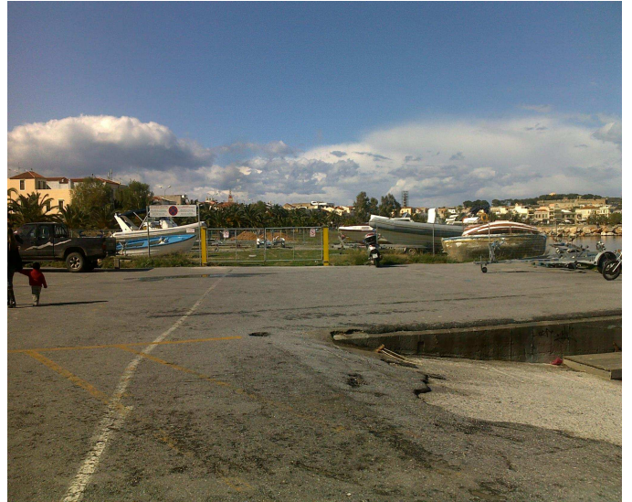
View of boat & trailer storage area