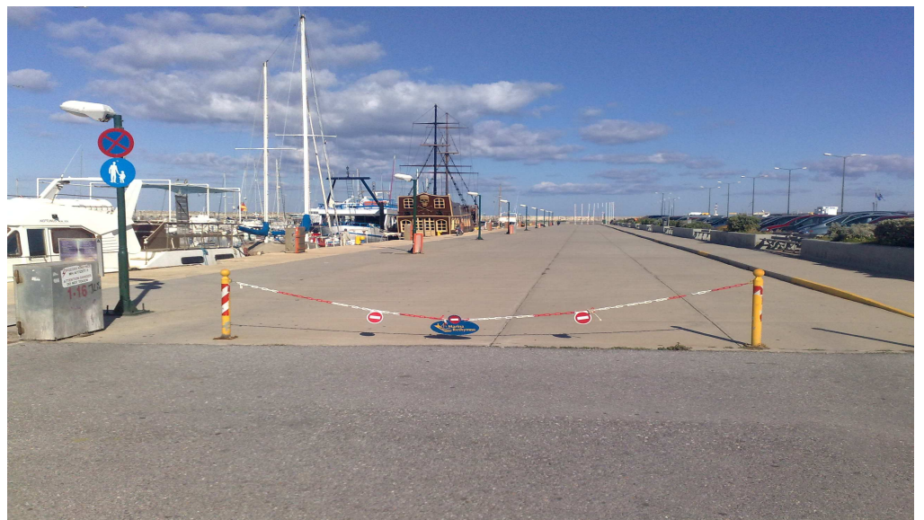
View of the pedestrian zone in the Marina of Rethymno