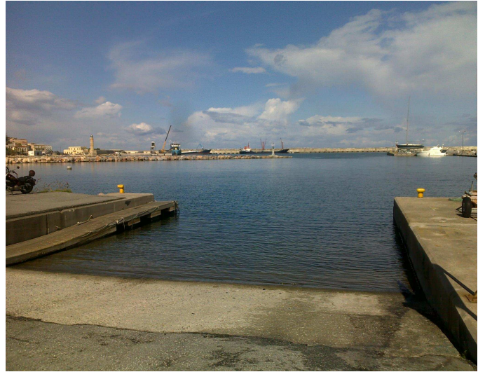
View of boat-Lifting ramp