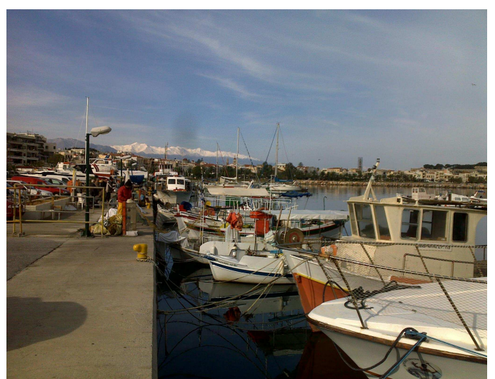
View of pier F – Marina of Rethymno