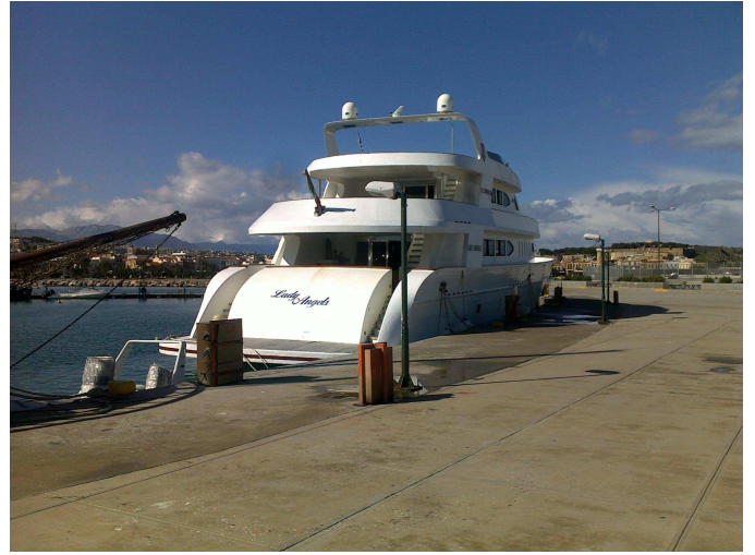
View of pier B – Marina of Rethymno