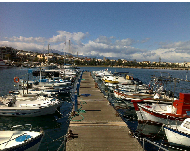
View of pier E – Marina of Rethymno