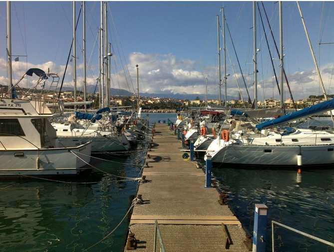
View of pier C – Marina of Rethymno