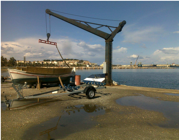
View of boat-lifting crane