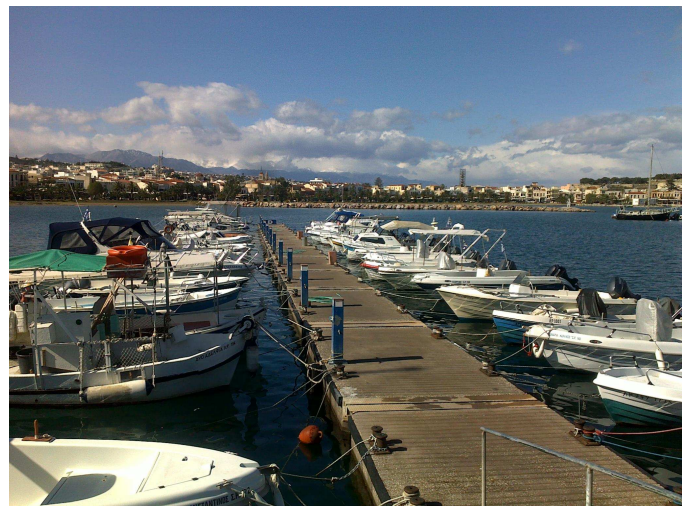
View of pier D – Marina of Rethymno