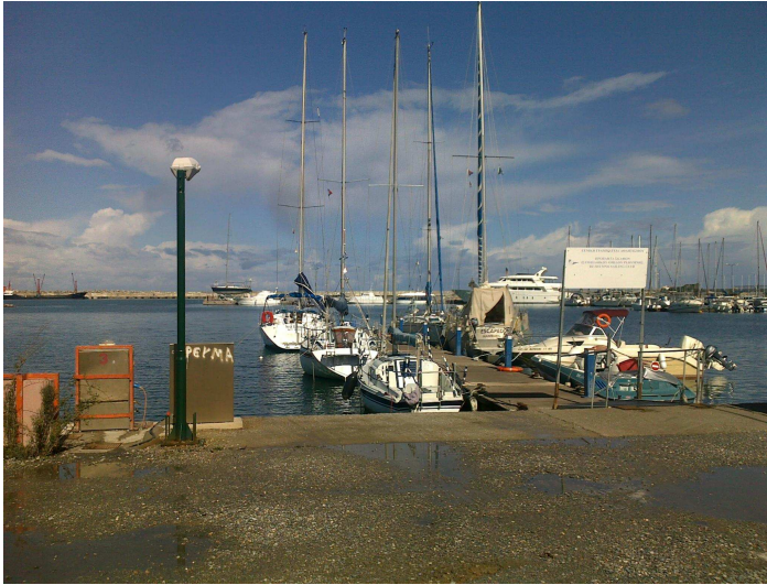
View of pier G – Marina of Rethymno